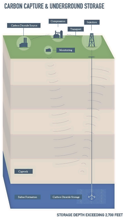
CARBON CAPTURE & STORAGE DIAGRAM

CCS technologies can vary drastically in implementation as well as cost. Currently, there are three main methods to capture CO 2 :